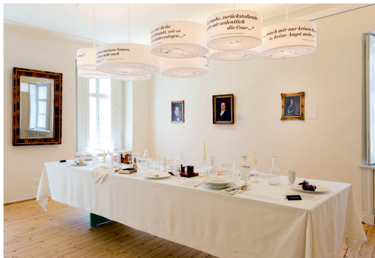
Be Beethoven's guest

The museum shop located on the ground floor offers a wide range of souvenirs, including a fine selection of CDs.