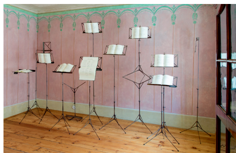
The recovered wall painting in Beethoven's living area.