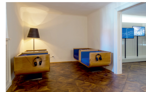
Exhibition area dedicated to the «Ninth»