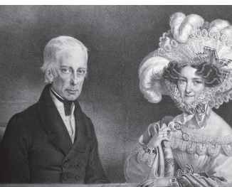
Emperor Franz I and his wife, Carolina Augusta

Ludwig van Beethoven regularly took the waters in Baden. When Emperor Franz I spent his summers there with his family, Baden was bustling with members of the high aristocracy and upper middle class, including patrons of the great composer. In the summers of 1821, 1822, and 1823, Beethoven lodged at Rathausgasse 10, where he composed important sections of his Ninth Symphony.