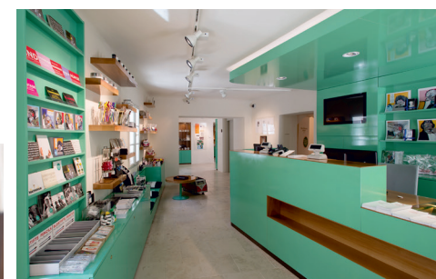
Entrance area and museum shop